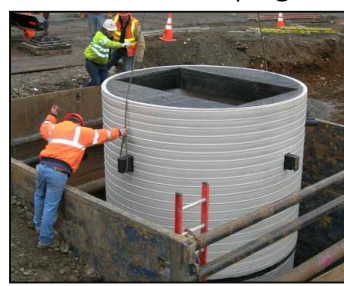
60" - 120" Wet Well: HDPE or Polypropylene Structure