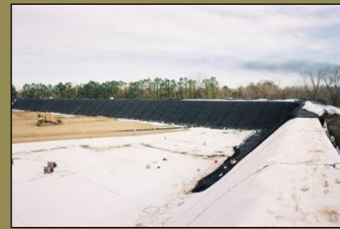
Cell Containment Liner