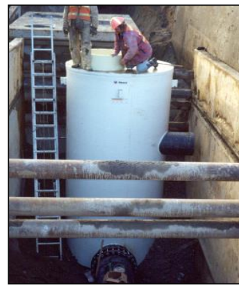
48" - 120" Manhole: HDPE or Polypropylene Structure