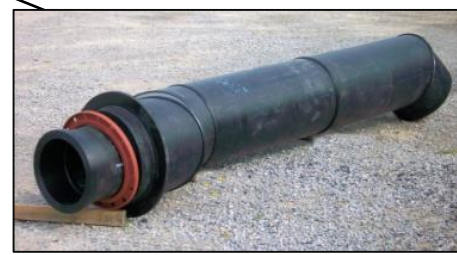
Dual Contained Piping: HDPE Piping