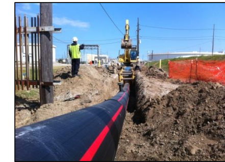
New/Rehab Firewater Piping