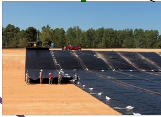
Lined Treatment Pond: Containment Area