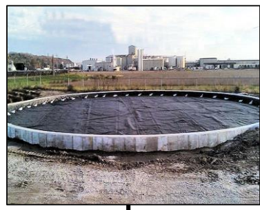
Secondary Bottom Liner