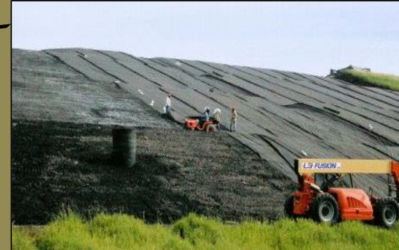
Geosynthetic Liner Cap